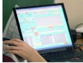
Find the right pair