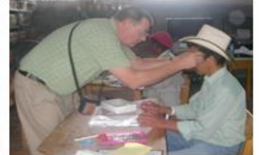
Fit the glasses