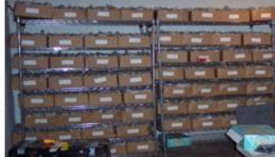
out of 4500 pairs