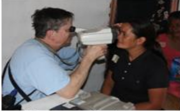
Measure their eyes

A free Glasses clinic will be provided from 9AM until 4:30PM (later if needed) on October 6 th , 2023 at Fern Creek Baptist Church. The sole service provided will be fitting the patients eyes with glasses out of an inventory of nearly 4500 pairs in an effort to improve their vision. An optical professional will be available.